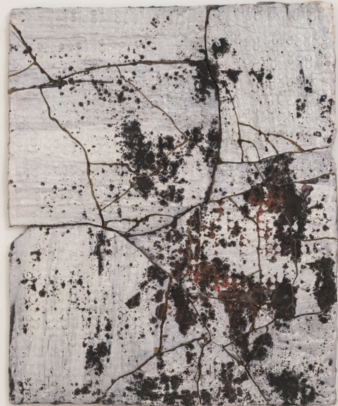
Pekka Paikkari - Haiku, 2024