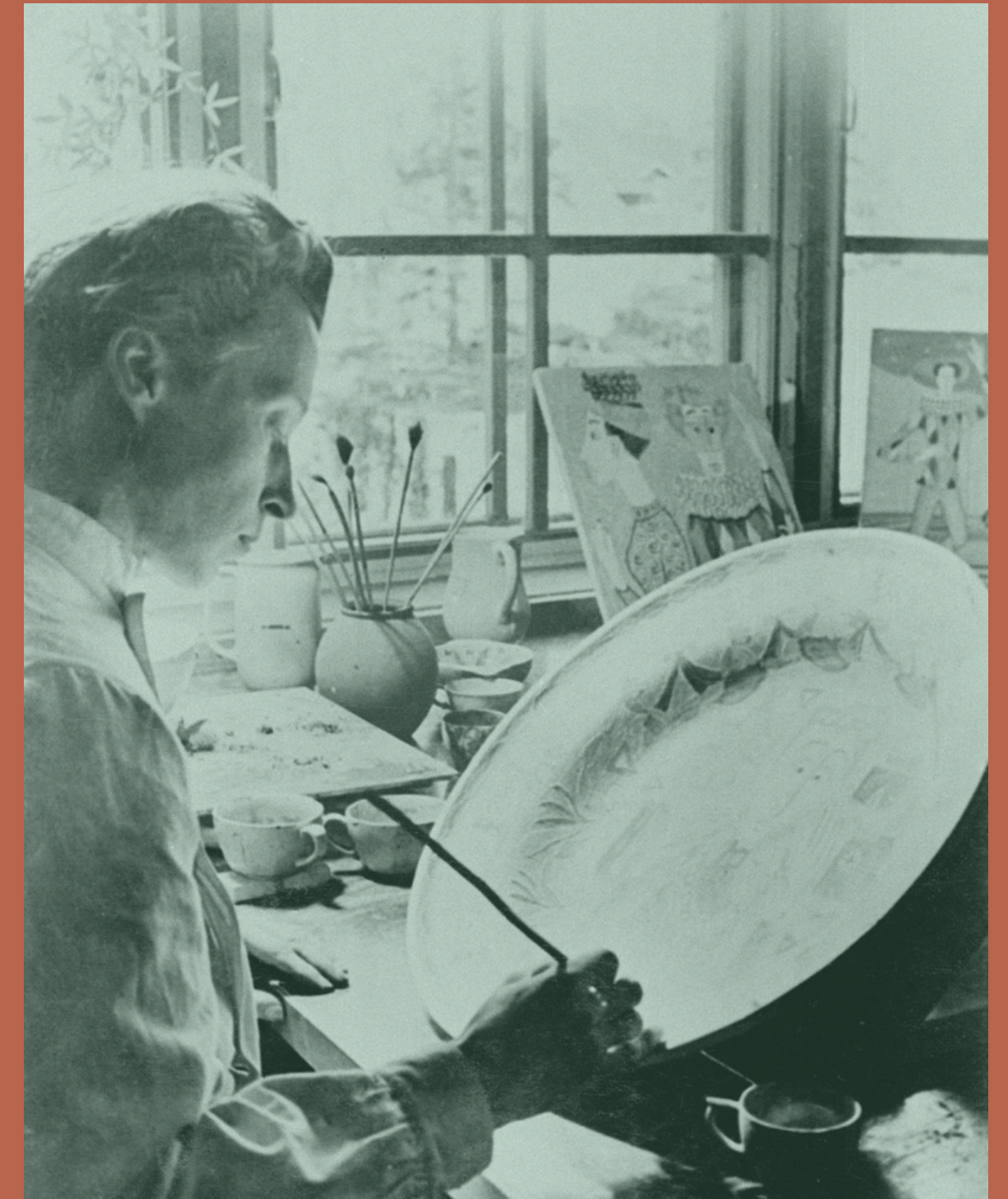
Birger Kaipiainen in the 1940s.