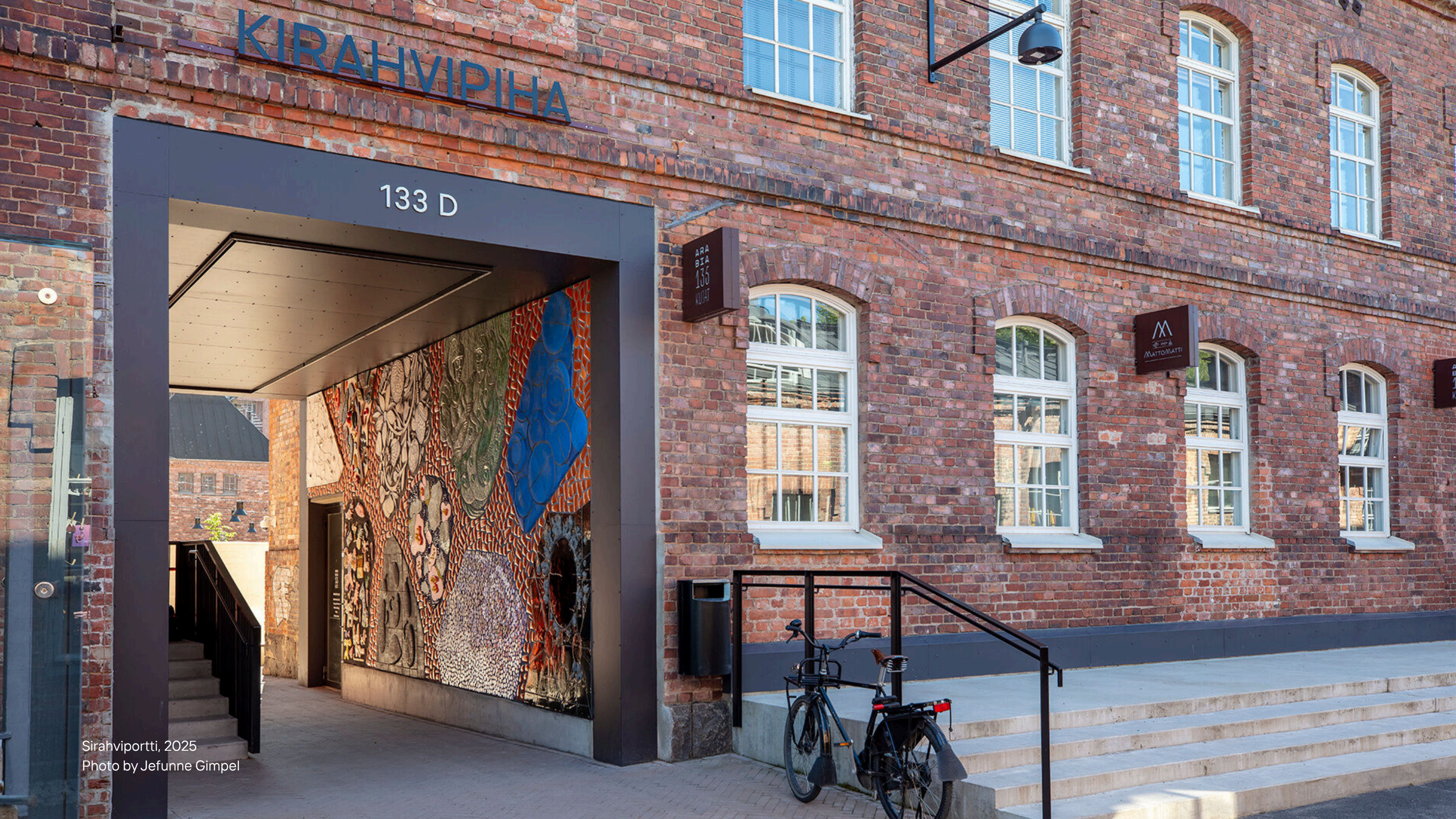
Sirahviportti, 2025