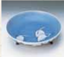
Tripod Dish with Underglaze Cobalt-blue Design of Heron (Nabeshima ware) Important cultural property