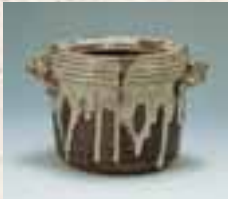
Water Jar with Ears with Straw-glaze (Chikuzen, Takatori ware)