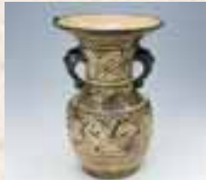
Sawankhalok-style Vase with Ears in Underglaze Cobalt-blue (Satsuma, Naeshirogawa ware)