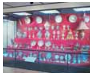
▲Kanbara Collection (deposited by Arita-machi)

This is the room in which the viewer can obtain knowledge of Kyushu ceramics. The history and characteristics of ceramics are shown in detail. The export Imari porcelains exhibited at the Kanbara Collection especially attract public attention.