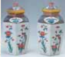
Hexagonal Jar with Overglaze Polychrome Enamel Design of Flower and Bird (Kakiemon style)