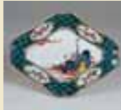
Rhombic Dish with Overglaze Polychrome Enamel Design of Boat Fishing (1650 - 1660s)