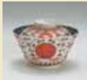
Lidded Bowl with Overglaze Polychrome Enamel Design of Jewel String and Red Ball (1710 - 1750s)