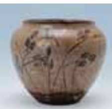
▲Jar with Underglaze Iron-brown Design of Bush Clover (Egaratsu type)

The Saga Prefectural Kyushu Ceramic Museum is engaged in the collection, conservation and exhibition of ceramic objects which are important materials in terms of history, arts and industry. It also spreads ceramic knowledge among the general public as well as conducts research activities and studies on ceramics.