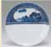
Dish with Underglaze Cobalt-blue Design of Landscape and Geometric Circle Pattern. (1650 - 1670s)