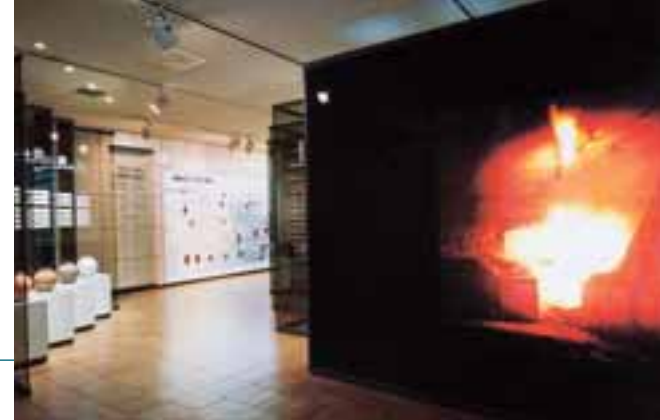
▲History of Kyushu Ceramics (Exhibit Room No.4)