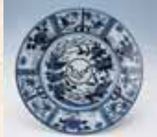
Kraak-style Large Dish with Underglaze Cobalt-blue Design of Phoenix (VOC mark)