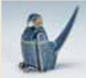
Bird-shaped Incense Container, Cobalt-blue Glaze (1630 - 1640s)