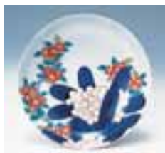
▲Dish with underglaze cobalt-blue and Overglaze Polychrome Enamel Design of Rhododendron and Azalea(Nabeshima ware)

In this room, the viewer is introduced to ancient ceramics produced at various kilns in Kyushu, such as Kogaratsu made in Hizen province, early Imari and other excellent porcelains produced in the Kakiemon style or at the Nabeshima clan kiln.